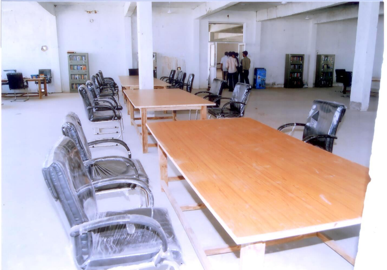
LIBRARY Reading Room